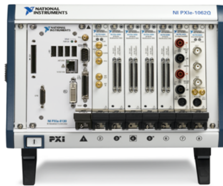
Figure 1. This NI PXIe-8130 controls an 8-slot PXI Express modular instrument and data acquisition system.

The NI PXIe-8130 features an NVIDIA MCP55 Pro chipset. This chipset provides four x4 ("by four") PCI Express lanes that are forwarded to the PXI chassis backplane to create four x4 PXI Express slots. Each of these slots has up to 1 GB/s of dedicated bandwidth with the overall system bandwidth of up to 4 GB/s.